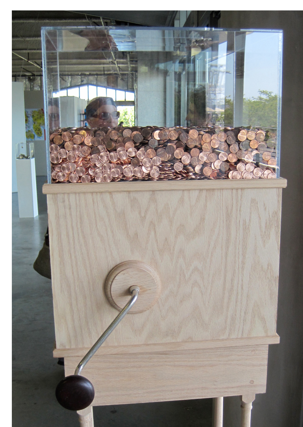
fig. 6. Hand-cranked minimum wage machine.