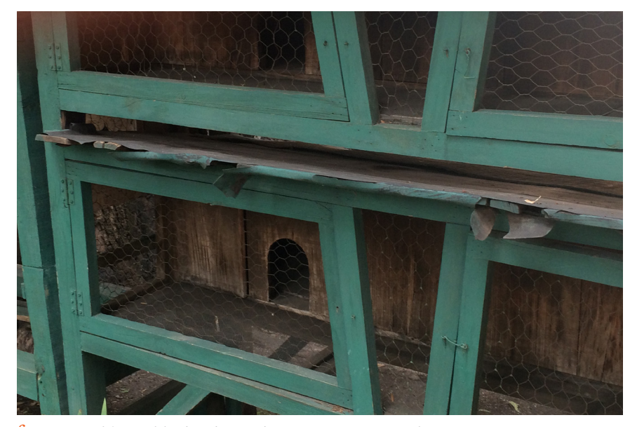
fig. 9. Crumbling rabbit hutches in the museum's courtyard.