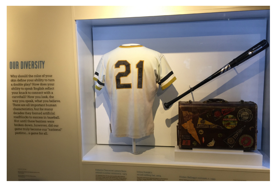
fig. 1. "We Are Baseball" celebrates the diversity of the baseball community.

On view at Principal Park, Des Moines, Iowa