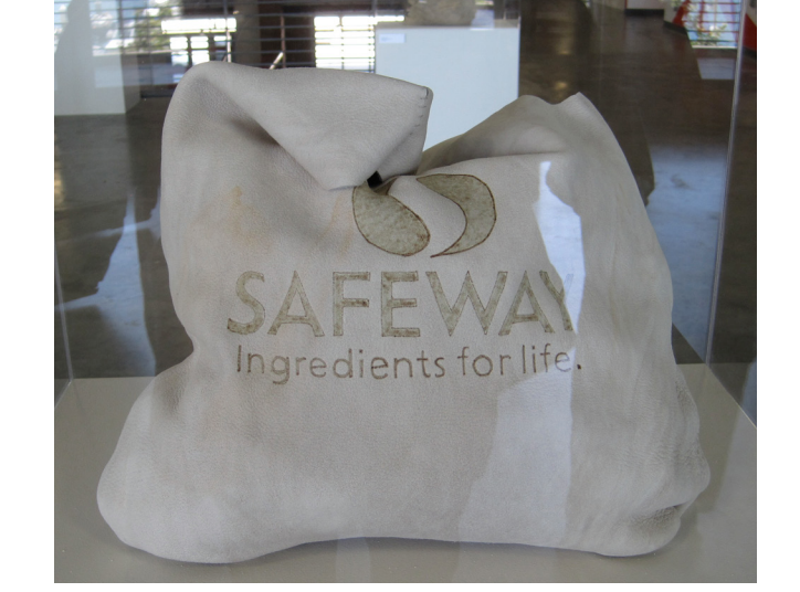
fig. 5. A leather shopping bag replaces the earlier petroleumbased version.