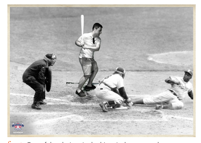
fig. 3. One of the choices in the historical moment photo interactive is Jackie Robinson stealing home during the 1955 World Series. Visitors are able to send the photos to their email address, and the author is pictured here.