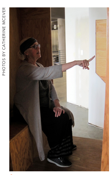
fig. 4. Video interview booth.