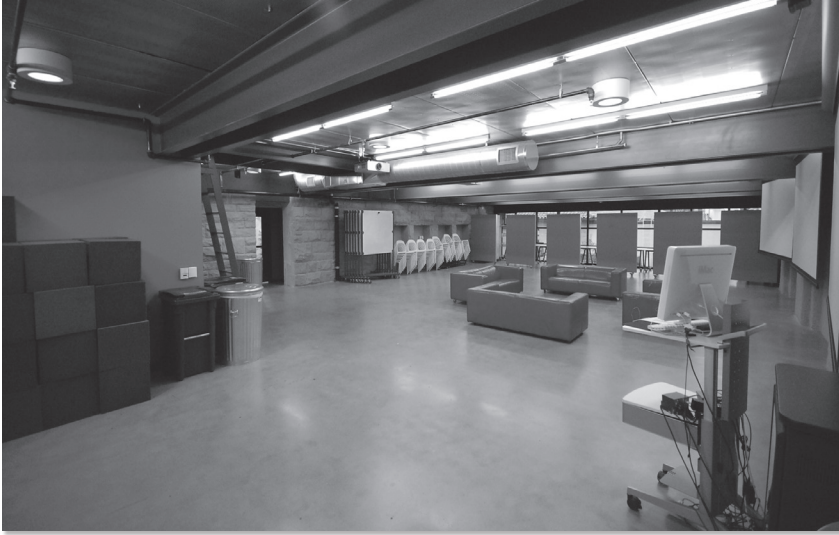
The default setting of a d.school Studio is a “blank slate” with assets stored at the edges of the room. This design allows participants to quickly set up of a wide range of room configurations to match their needs.