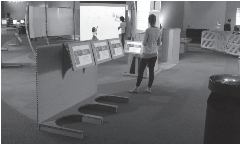
Full-sized cardboard prototypes of the Social Robots exhibition at The Tech allowed space designers to test visitor interactions before the final implementation.

Studio table at the d.school, the “Periodic Table,” is tall and square (see Doorley and Witthoft, 2012, pp.28-29). The shape of the table is intended to promote equality of participation (there is no “head” of the table) and momentum up , so that team members are oriented towards each other and any member of the team can rise quickly to position themselves actively in front of the group. A variety of seating options at the d.school also pair posture