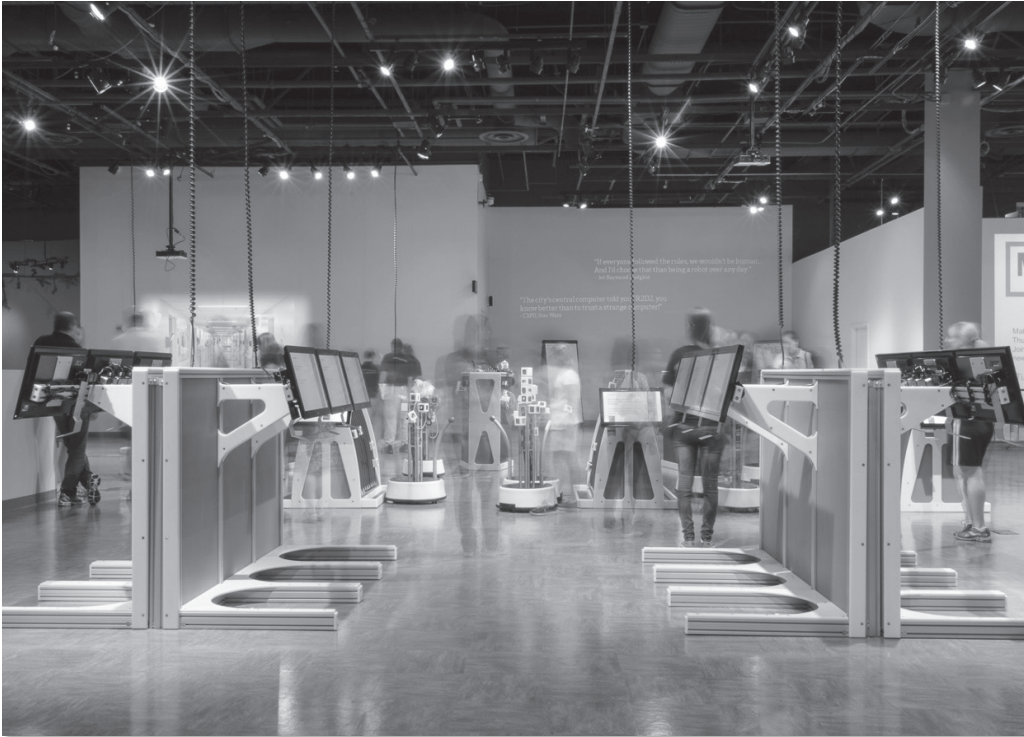
After the exhibition opening, designers continued to observe visitors interacting with the Social Robots exhibit at The Tech in order to continue iterating on the layout of the space.

are reset after each use into “default” arrangements, illustrated through signage, and the assets are put away in easily accessible storage spaces. Prior to any activity, teachers and students must adjust the space with intent. Conventional amphitheater-style seating is an excellent orientation for witnessing a single source, but for a class activity that requires collaborations and conversation among five teammates, a variegated arrangement of tables, stools, and white boards might be more appropriate. This effort to support a range of orientations was a dramatic step in giving individuals permission to take ownership over the space at the d.school.