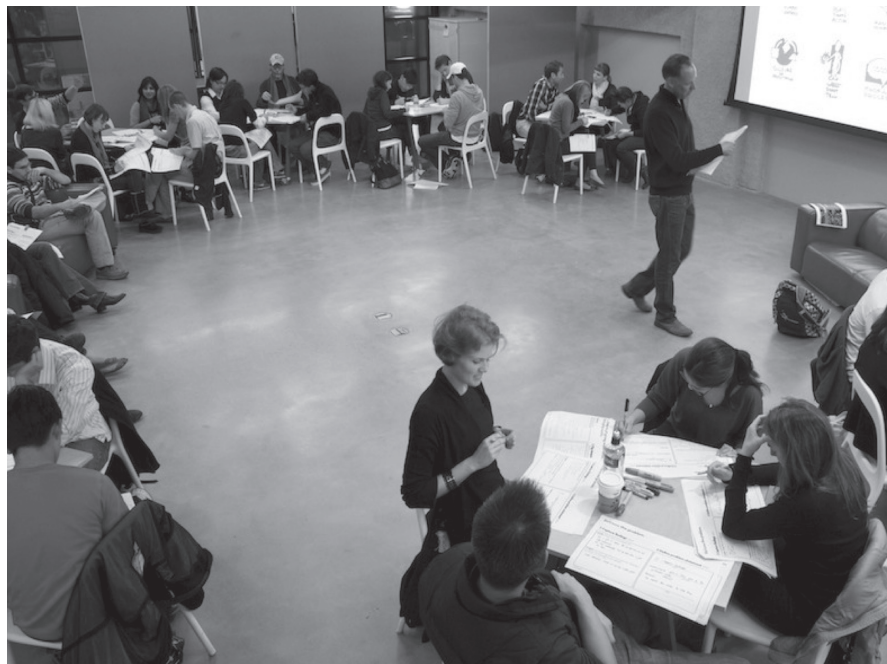
The d.school Studios are not traditional classroom spaces. Students and teachers have access to a variety of assets and seating options so that they might design the space with intent.

1) the types of postures the space affords, 2) the orientation of assets and people within the space, 3) the density , or the size of the space in relation to activities and assets within it, 4) the surfaces that support activities that take place there, 5) the ways that lighting, sounds, color, and other aesthetic elements can shape the ambience , and 6) the storage or open access to usable assets within the space. (For a full description of these properties,