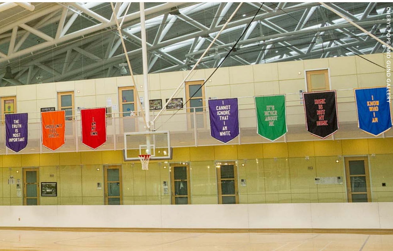
fig. 1. Installation view of Pope’s banners hanging around the periphery of the MAC court in the Kenyon Athletic Center.