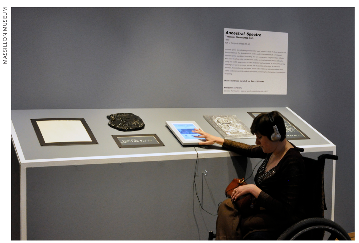
fig. 5. A patron interacts with a touchscreen app at the exhibition opening. We invited patrons with blindness and low vision and their families to experience the exhibition an hour before the public reception.