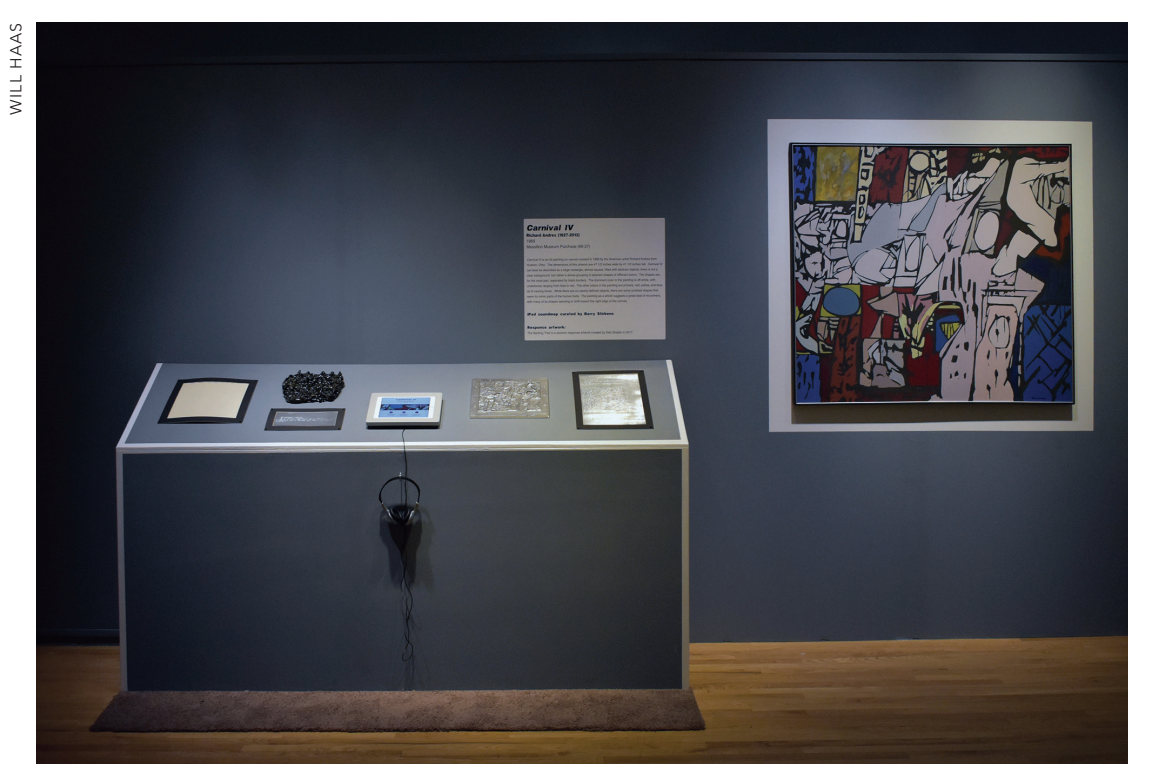
fig. 6. Each kiosk includes the following elements (left to right): a tactile gallery map; a response artwork with a braille label; an iPad* app with headphones; a tactile, aluminum model with a braille label to the right; and a large-print label (above the kiosk).