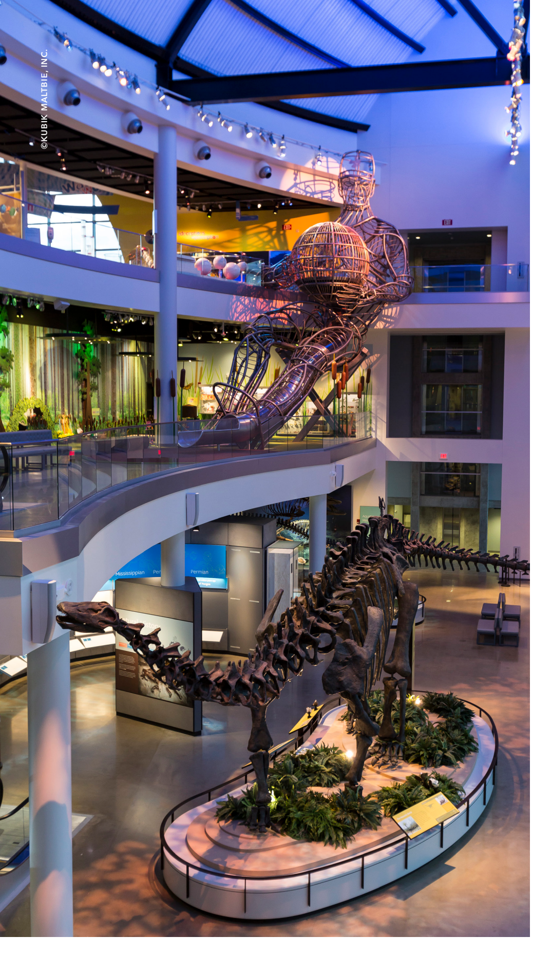
fig. 1. Discovery Park of America presented a great opportunity for Kubik Maltbie, Inc. to utilize the design/build method to execute a very large and complex project, benefiting the museum in several ways. The museum had limited resources and experience, and needed additional outside personnel to drive the planning process. Both budget and schedule were very tight for a such a large project. The design/build method provided continuous budget checks throughout the process, ensuring that as designs were completed items were on budget and ready to build. Finally, with design/build, the team could transition exhibits into production as designs were finished, rather than waiting on a complete design package, which helped the schedule.