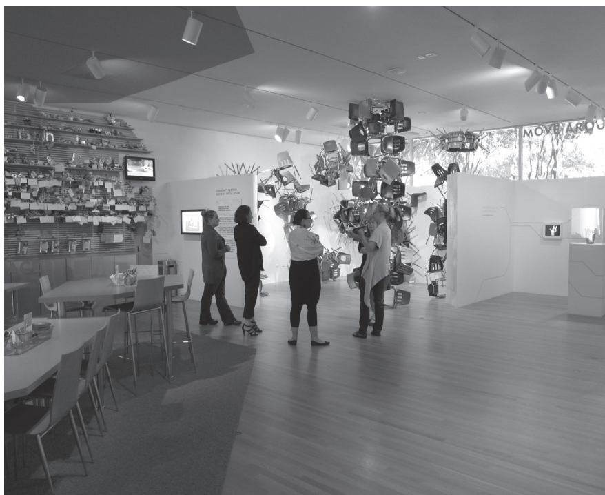
The team had initial meetings to review drawings and do gallery walk-throughs to evaluate the space for new activities and audiences. (Center for Creative Connections, Dallas Museum of Art).

This is the study of a space that needed a way to work more iteratively and experimentally. The Center for Creative Connections (C3) is a 12,000 square-foot, elegant, and highly participatory space that involves visitors in "active learning about the DMA's collections." (B. Pittman, E. Hirzy, 2010). Their first two exhibitions were on broad themes (such as Materials or Space) and featured works across the collection. Works were connected to the theme visually yet not necessarily conceptually. Hands-on activities were adjacent to the works. While successful in terms of participation, evaluation showed visitors were not connecting with the ideas in the works themselves (Dallas Museum of Art, 2008). Also, mounting these single-theme, complex exhibitions consumed extensive time and resources, leaving little room for the trial and error approach that innovation requires. As a result, C3 Director Susan Diachisin wanted to explore alternative approaches to internal exhibit development and design of future exhibitions.