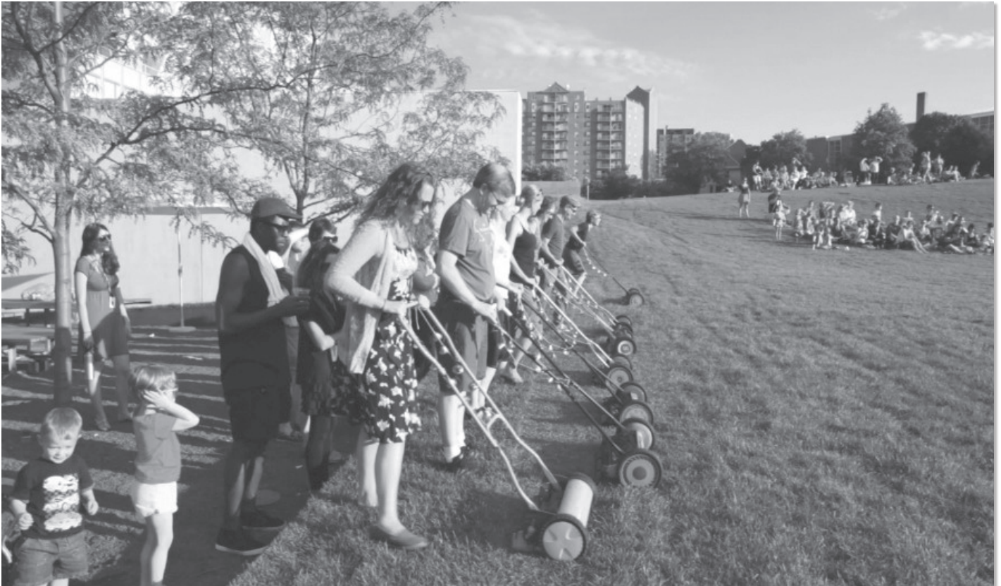
An orchestrated performance of lawn mowers brought in by the public called "The American Lawn And Ways To Cut It" (Machine Project, Open Field, Walker Art Center).