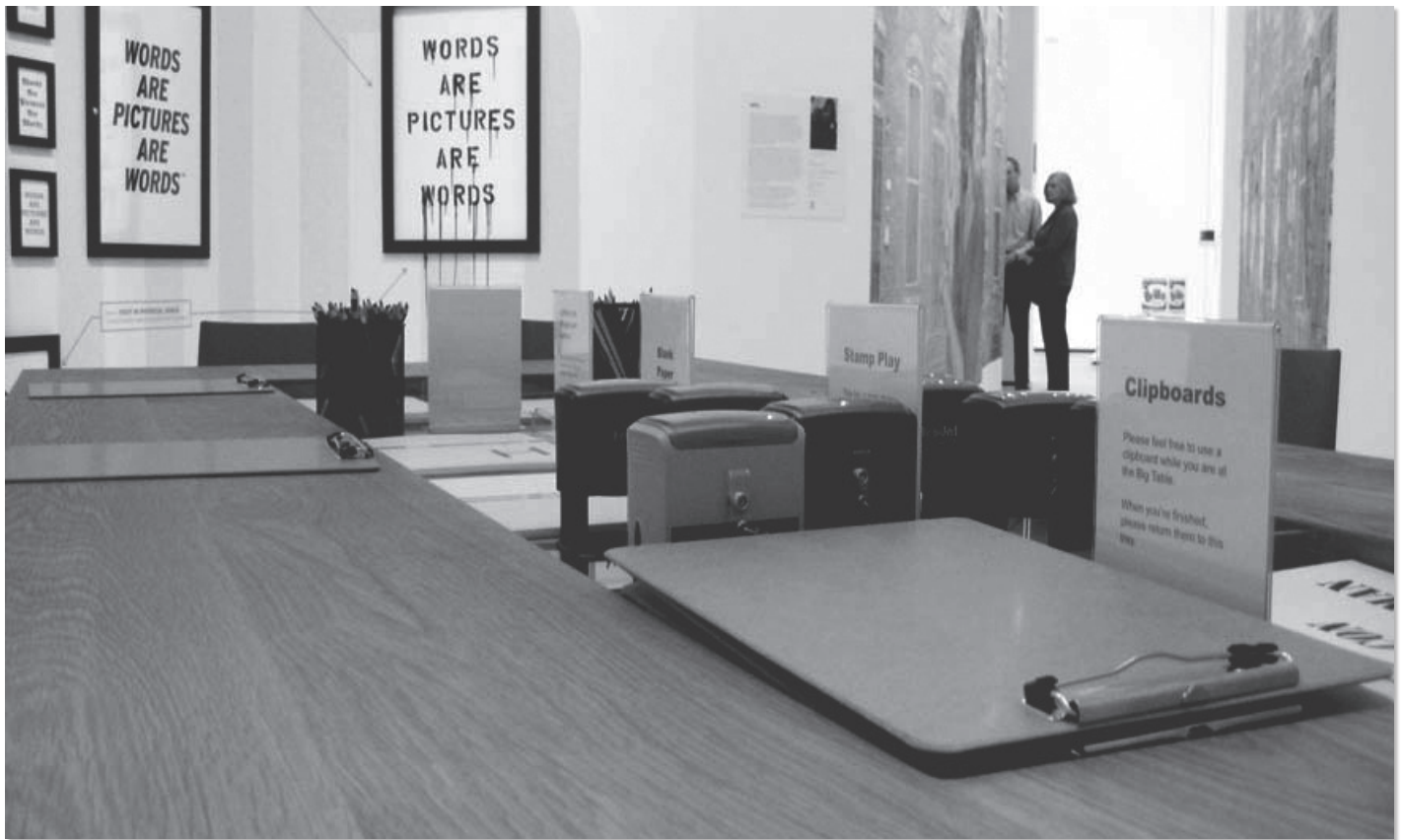
"The Big Table" was custom designed by a local artist with a trough for materials that could be covered for events. Its design was informal enough to warm up the formal space.

series of pegs on the wall into the design. Visitors could use these to hang their work. Not long after opening, each of the pegs on the wall was covered many drawings deep, and people of all ages were participating. Their results were smart, inventive, and funny—a high caliber of work for an unmediated experience. This meant we were achieving the primary goal of the project: to expand on visitors' experience with contemporary art and to prepare them for further engagement in the art galleries.