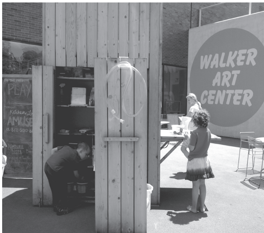
Visitors could freely use the “Open Field Tool Shed” when it was staffed, for programs or play at the Walker.

in the space between the subjective experience of the visitor and a work of art? Are we impeding artists’ intent (and essentially doing a disservice to them) when we bring design into the art museum?