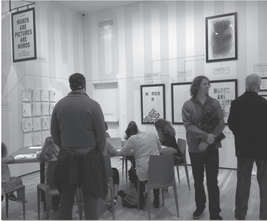
"The Big Table" at the Baltimore Museum of Art was designed to introduce visitors to contemporary art in the adjacent galleries through activities tied to a contemporary art theme.